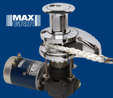
RC10 with top mounted capstan

Extra deck clearance kit Capstan model Foot Switches AutoAnchor 150 and 500 Series Rope/Chain and Chain Counters Maxwell Chain Spacer Kit