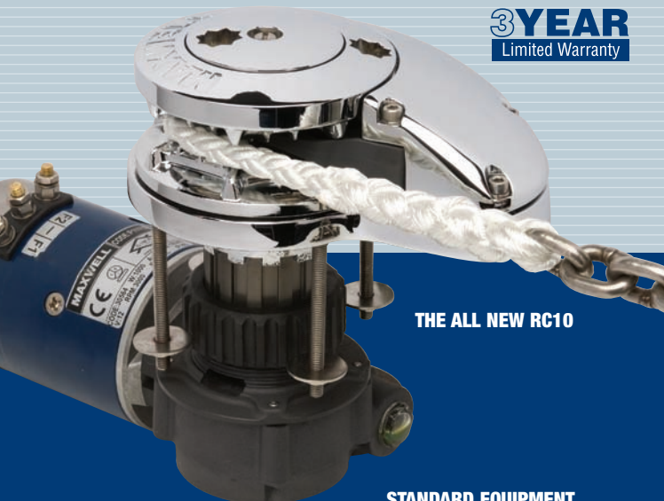
THE ALL NEW RC10